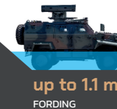
BORDER SURVEILLANCE & SECURITY